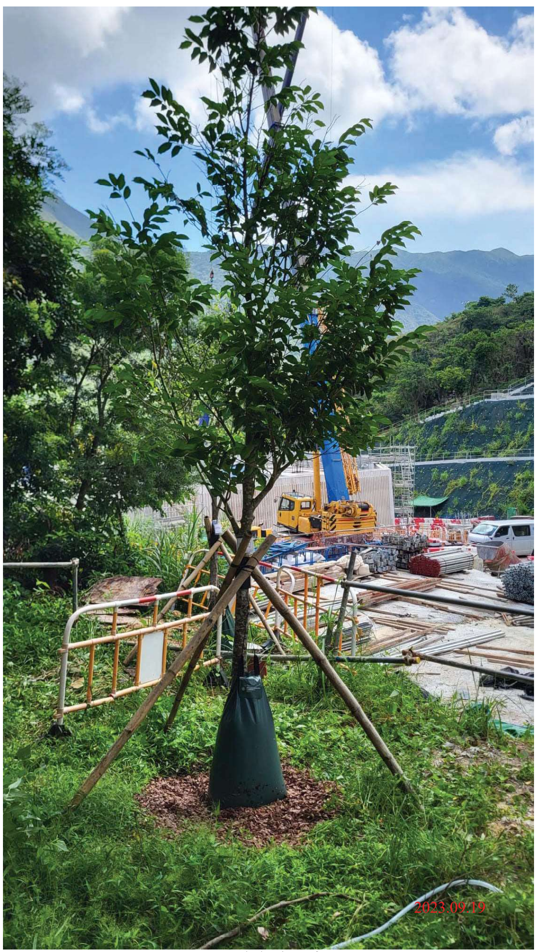
RP02-Whole view of tree

Tung Chung New Town Extension—Salt Water Supply System Monthly Monitoring Report for the 3 Nos. Replacement Planting Aquilaria sinensis (September 2023) Ref.: C3113/23/TGD5572 Date: 29 September 2023