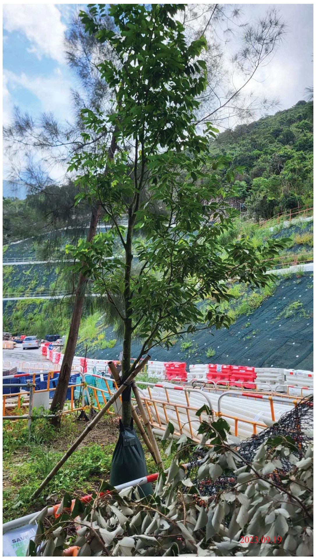
RP01-Whole view of tree

Tung Chung New Town Extension—Salt Water Supply System Monthly Monitoring Report for the 3 Nos. Replacement Planting Aquilaria sinensis (September 2023) Ref.: C3113/23/TGD5572 Date: 29 September 2023